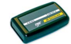
IR DATALINK USB ADAPTER